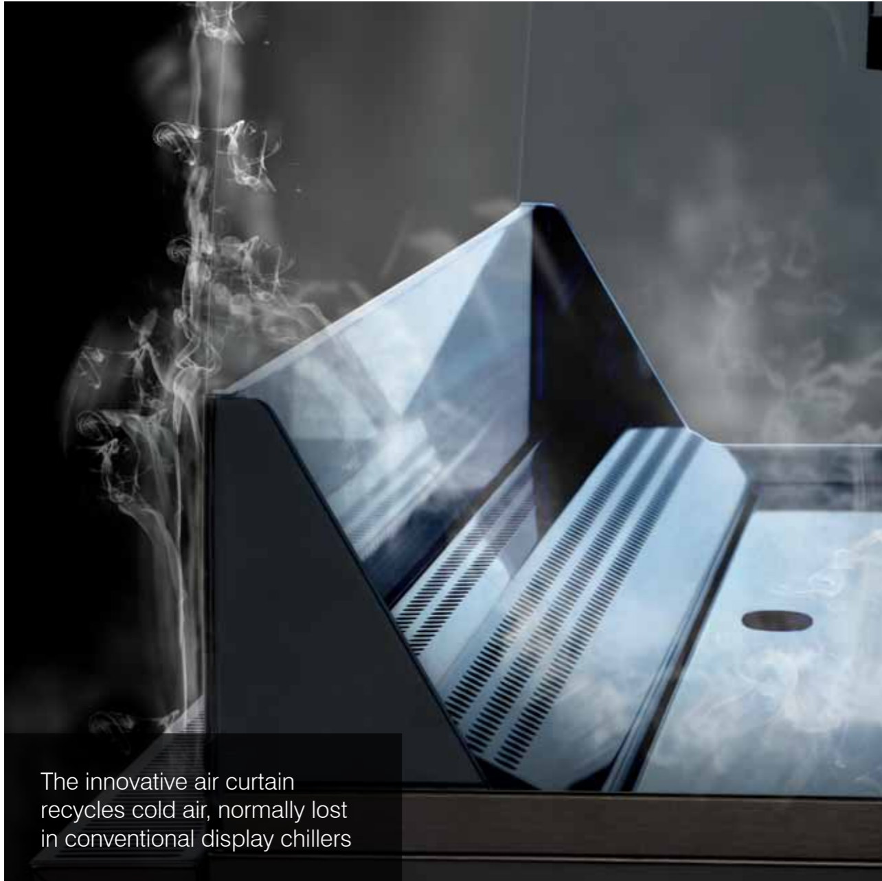
The innovative air curtain recycles cold air, normally lost in conventional display chillers